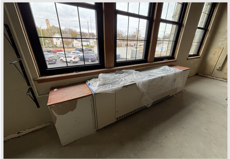
New unit ventilators have been installed and are ready for power connections and programming!