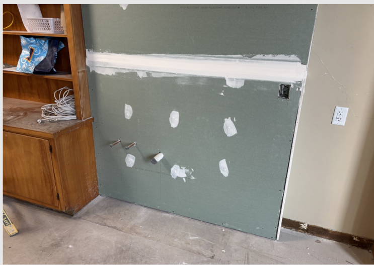
New furred stud wall in place for plumbing rough-ins. New casework and a sink will be installed at this location.